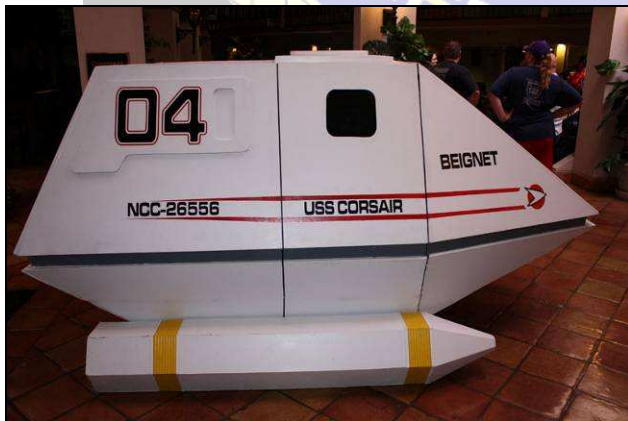
Shuttle Pod Beignet from the USS Corsair.