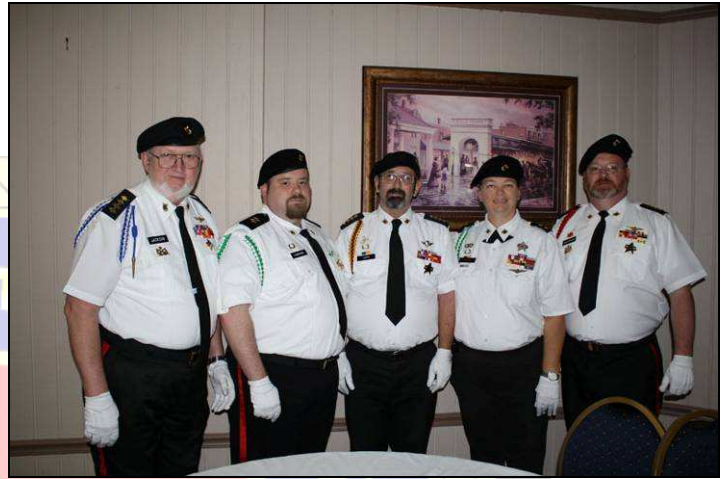
2012 Marine Honor Guard