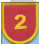
Second Brigade Flash

Embroidered Beret Flash: Red with gold lettering and stitching.