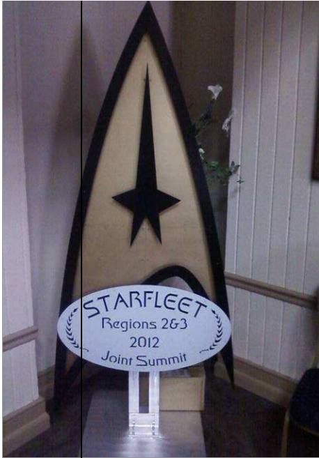
The welcome sign from the joint Region 2, Region 3 Summit in Hammond, La.