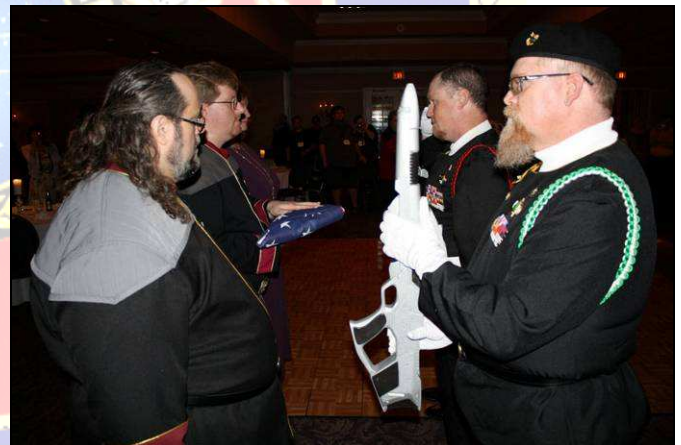
Final Mission Ceremony on Saturday night.