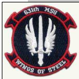
631st MSG Unit Patch

Here are items for sale from the USS Tiberius Quartermaster . All items are produced by the USS Tiberius and sold to members at a discounted price. Shipping and handling prices are a flat $3 for as many items as you like. Select "Shipping" and add it to your shopping cart. However if you wish to pick these items up at a meeting or from the Commanding Officer then there is no charge for shipping.