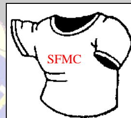
SFMC 2 nd Brigade T-Shirt